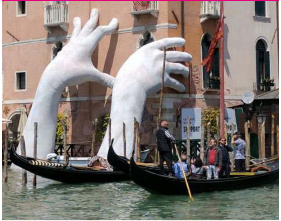
'SUPPORT' VENICE, Lorenzo Quinn 2017

This 'one of a kind' sculpture was unveiled at the 57th International Art exhibition of the Venice Biennale. The bold piece greeted residents and visitors of Venice reminding them of the city's relationship with water.